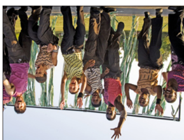
Pictured above: Local teens act in the STEP program at Herman Park last summer.