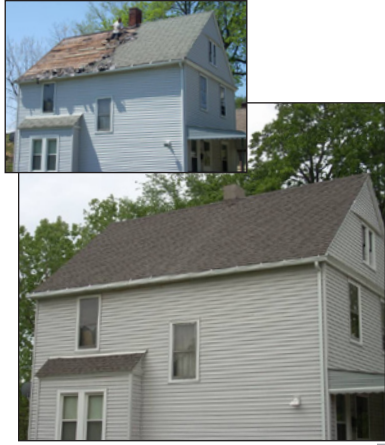
A new roof was installed at a home on Rutledge Avenue when the owner took advantage of utilizing a Model Block grant. Similar improvements are available through the Home Improvement Program.