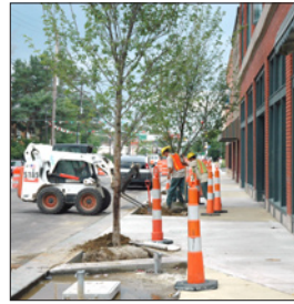
Streetscape construction on the north side of Detroit Avenue is nearing completion.

By early July, 2009, the Streetscape on the north side of Detroit Avenue will be fully complete and construction will have shifted to the south side. The same process – utility pole removal, widening of sidewalks, and placement of artistic elements such as pavers and benches – will repeat on the south until construction is completed in September.