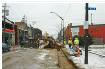
DETROIT AVENUE STREETScape CONSTRUCTION MOVES ALONG, RIGHT ON SCHEDULE

If you've been on Detroit Avenue lately, you have noticed heavy machinery and construction workers staying busy despite chilly winds and swirling snow. The transformative Detroit Avenue Streetscape project is proceeding on schedule towards its Fall 2009 completion.