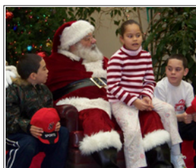
SANTA VISITS WITH NEIGHBORHOOD KIDS

The Gordon Square Arcade was once again filled with laughter and smiles from children eagerly awaiting the arrival of Santa Claus. This year's DSCDO Annual Neighborhood Holiday Party on December 6th was as successful as previous years in bringing joy and excitement to the children and families of the Detroit Shoreway neighborhood. At any given time during the party, nearly 1,000 people filled the halls and atrium inside the historic building.