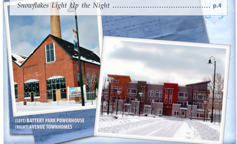
(LEFT) BATTERY PARK POWERHOUSE (RIGHT) AVENUE TOWNHOMES