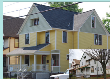
5702 Franklin Boulevard, before and after rehabilitation

Since the program's inception, over 75 abandoned properties and underutilized vacant lots have been transitioned into the hands of responsible developers and owners. This has resulted in over $5 million in investments in scattered-site single-family properties.